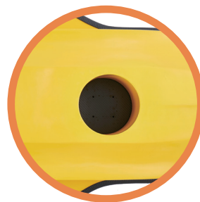
ADCP access shaft